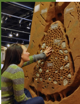
Exhibit patron exploring the termite mound in the Sustainable Shelters exhibit.

If you haven’t had a chance to tour our Sustainable Shelters exhibit yet, get here soon before it’s gone! Sustainable Shelters is on loan to the Arboretum from The Bell Museum of Natural History in Minneapolis,